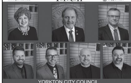
YORKTON CITY COUNCIL

306-786-1701 mayor@yorkton.ca www.yorkton.ca City of Yorkton City of Yorkton cityyorkton