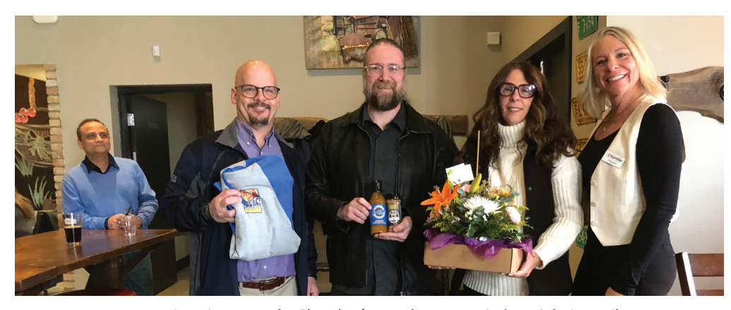
Door prize winners at the Chamber's Member Appreciation Night in April