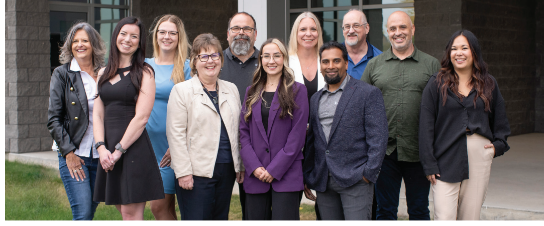
The 2023 Chamber Board and Staff.

You work hard in your business and for your business. You invest in your business by belonging to business organizations such as the Chamber of Commerce. As "the voice of business in Yorkton and district", the Chamber's purpose is to work for you on the opportunities and issues facing the entire business community. 430 voices are louder than just one. Below is a summary of the 2023 highlights: