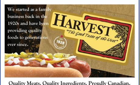
Quality Meats. Quality Ingredients. Proudly Canadian. harvestmeats.ca 👖 🎯