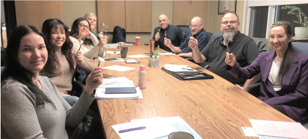
It's not all serious work when the Chamber Directors get together! Committee and Board meetings are a great way to learn more about the business community.

Are you a member of the Yorkton Chamber? Are you interested in serving on a Board that is dynamic and positive? Do you want to expand your business network? If you answered yes to any of these questions, you may want to consider becoming a Director of the Yorkton Chamber of Commerce.