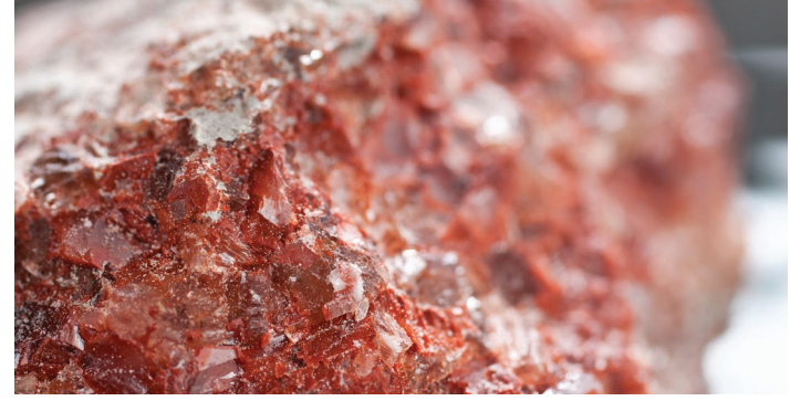
Potash to be considered a prioritized critical mineral.