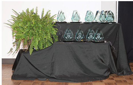
Who will take home these coveted awards?

Call the Chamber office to place your order (306-783-4368 or info@yorktonchamber.com)