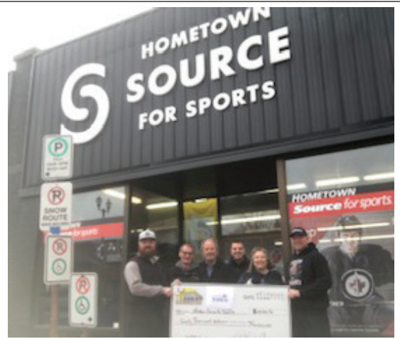
Chamber member Home Town Source for Sports was one of many businesses which took advantage of the Business Improvement Incentive Program

With spring in our sights, you may be thinking about doing some upgrades to your commercial building. Be sure to check out the Business Improvement Incentive Program available from the City. Incentives are available for façade and storefront improvements. And if the building is located in the Yorkton Business Improvement District (YBID), further incentives are available. There are also incentives for Business Creation & Expansion; Vacant Building Tax Abatement; and Residential Construction . To learn more, visit the city's web site yorkton.ca/en/build-invest-and-grow/city-incentives