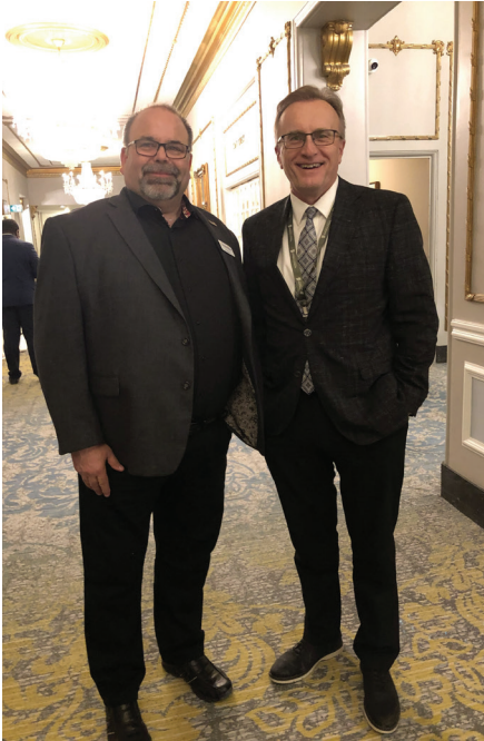
President Doug Forster with Hon. Jim Reiter, Deputy Premier and Minister of Finance.

A reception followed allowing attendees to visit with the Opposition MLAs, Cabinet Minister and other Chamber members.