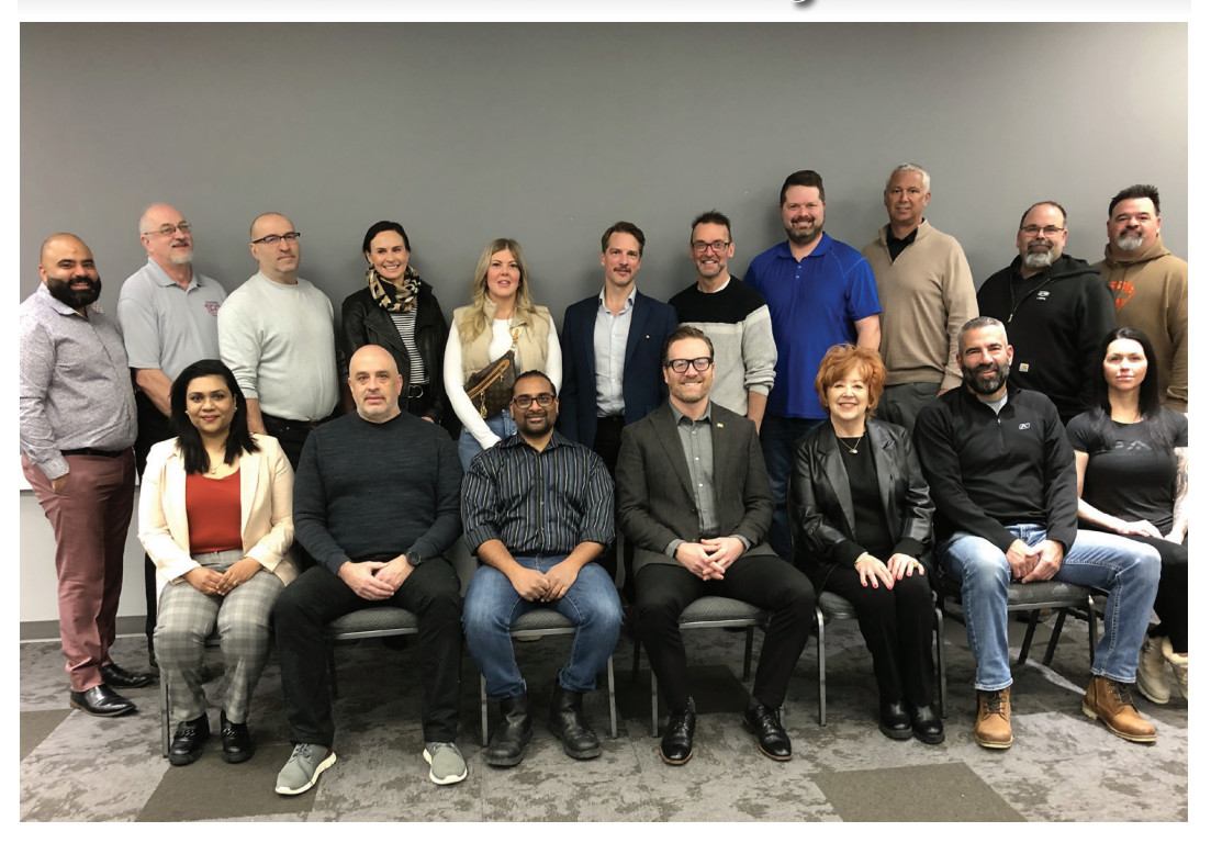
The Chamber's Policy and Business Development committees recently met with City Council. A variety of topics relevant to the business community such as property taxes and assessment; and economic development were discussed. The 2 entities plan to meet again in March. The Chamber commended City Council for holding an open Special Meeting of Council Feb 6 to introduce its 2025 Budget. To view the Budget meeting, visit yorkton.ca/Council and click on Feb 6

Have you ever wondered what it is a Chamber does? The purpose of a Chamber is to be the voice of the business community.