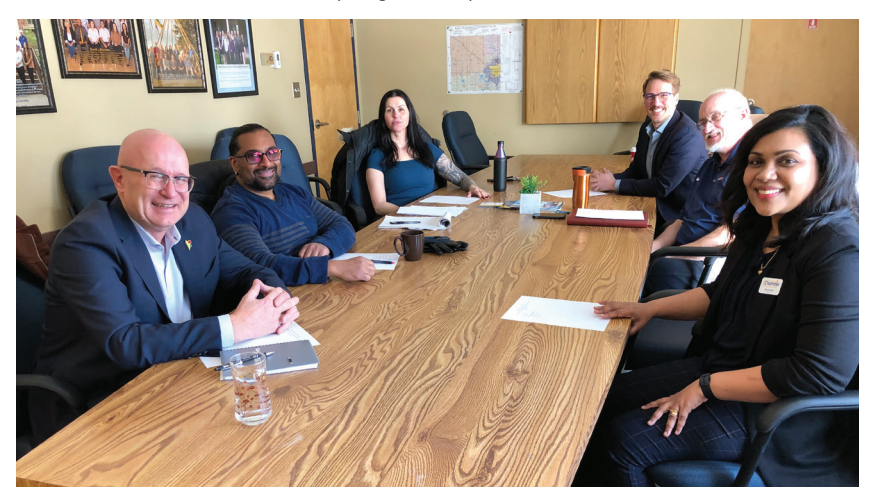
Members of the Yorkton Chamber's Policy committee met with Hon. Warren Kaeding, Minister of Trade & Export Development; and Minister Responsible for Innovation. A good exchange of information occurred as a number of topics relevant to economic development in and around Yorkton were discussed.