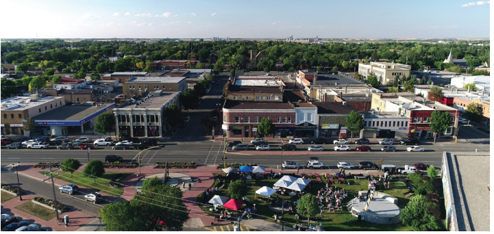
Panaoramic view

This is just a sampling of the many good things about Yorkton that makes a small group of people proud. What is it about Yorkton that makes you proud?