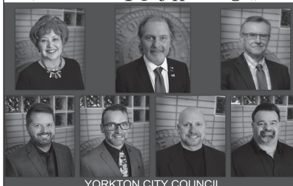
YORKTON CITY COUNCIL

City of Yorkton City of Yorkton City of Yorkton