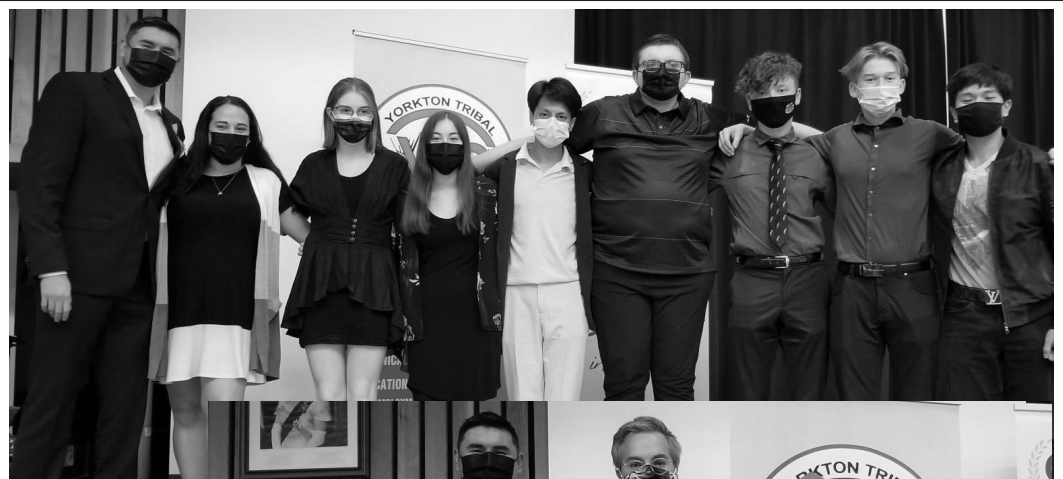
Mosaic sponsored high school students from the YRHS and Dreambuilders to attend the Chamber Business Dinner

The next big Chamber event will be the Celebrate Success Business Awards in April. Watch for details.