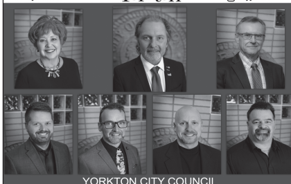
YORKTON CITY COUNCIL