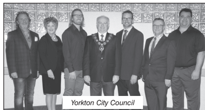
Yorkton City Council