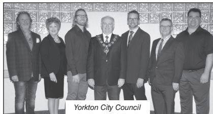
Yorkton City Council