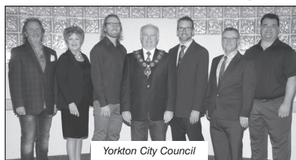
Yorkton City Council

We started as a family business back in the 1920s and have been providing quality foods to generations ever since.