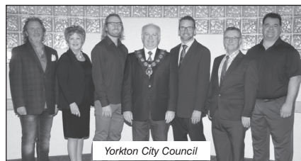
Yorkton City Council

We started as a family business back in the 1920s and have been providing quality foods to generations ever since.