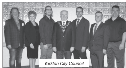
Yorkton City Council

We started as a family business back in the 1920s and have been providing quality foods to generations ever since.