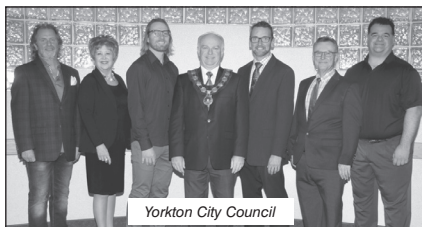
Yorkton City Council

We started as a family business back in the 1920s and have been providing quality foods to generations ever since.