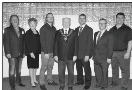
Yorkton City Council