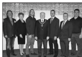
Yorkton City Council