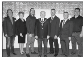
Yorkton City Council

We started as a family business back in the 1920s and have been providing quality foods to generations ever since.