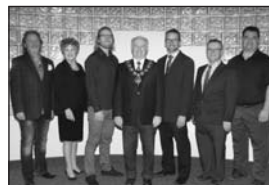
Yorkton City Council

786-1701 mayor@yorkton.ca www.yorkton.ca