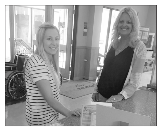
While out and about during July and August, the Chamber staff stopped in at various member businesses to have a chat and ask a few questions. Once the questions were answered, a photo was taken of the member and posted on the Chamber's facebook page.