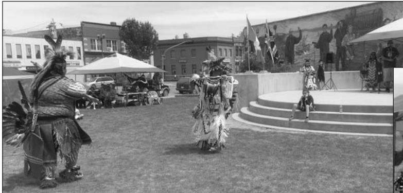
The Yorkton Chamber of Commerce was honoured to be invited to participate in the Grand Entry at the National Indigenous Peoples Day June 21 held in the City Centre Park. This is a day for all Canadians to recognize and celebrate the unique heritage, diverse cultures and outstanding contributions of First Nations, Inuit and Métis peoples. The Canadian Constitution recognizes these three groups as Aboriginal peoples, also known as Indigenous peoples.