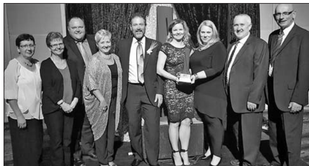
Cornerstone Credit Union Board & Staff accepted the Sask Chamber's ABEX Award for Community Involvement. Other Yorkton Chamber members who were finalists in a variety of categories include CORE Real Estate; NL Construction; RH Electric; and TA Foods.

Junction of Highways #9 & #16 Box 1051, Yorkton, SK S3N 2X3 Ph: (306) 783-4368 Fax: (306) 786-6978