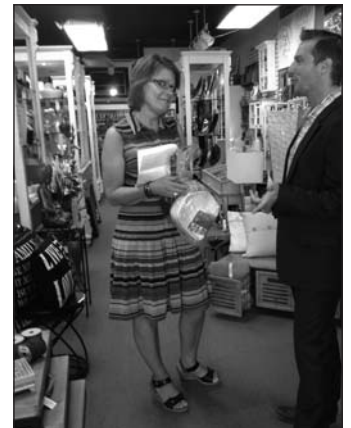
During the 2016 Business Walk, the Chamber visited 16 members