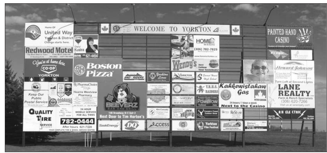
Spaces on the Sign Board are disappearing. Your sign could be here. Ask about the new rental rates!