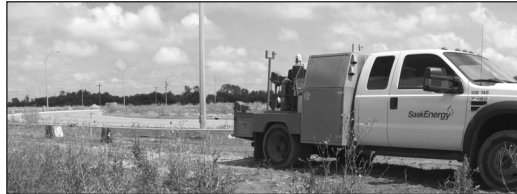
Development Levies pay for the cost of installing infrastructure in green land and for infrastructure upgrades in in-fill.