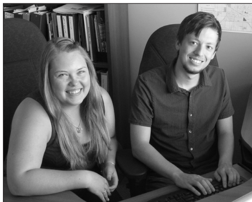
Entrepreneurs between the ages of 18 and 39 years, may qualify for start-up financing through Futurpreneur Canada.

Futurpreneur Canada offers resources to young entrepreneurs between the ages of 18 and 39 years, including start-up financing!