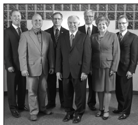
Yorkton City Council

786-1701 mayor@yorkton.ca www.yorkton.ca