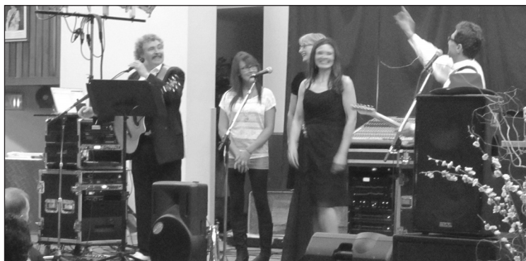
The Hot Tamales, a musical duo from Saskatoon, entertained the crowd with their music and antics on stage!