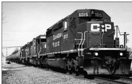
Yorkton Protective Services plans for ensuring emergency services are provided when trains block railway crossings.

The Business Development Committee thought it important for the business community to know