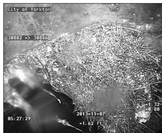
The remote robotic crawler took this photo showing a root mass in a city sewer.

The presentations from this meeting can be found on the city's website www.yorkton.ca Click on Broadway Street Reconstruction.