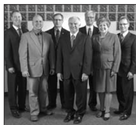
Yorkton City Council

786-1701 mayor@yorkton.ca www.yorkton.ca