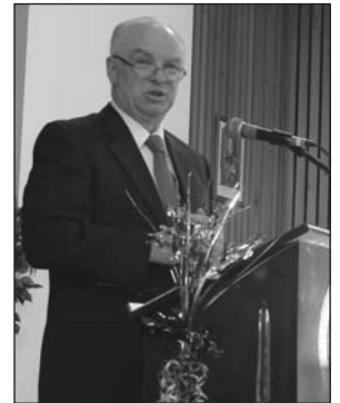
Mayor Bob Maloney brought greetings from the City.