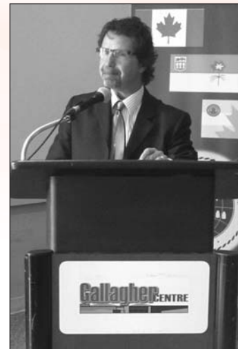
In recognition of Tourism Awareness Week in the province, Pat Fiacco, CEO of Tourism Saskatchewan was the Guest Speaker at a recent Chamber Business Lunch. He said Saskatchewan is full of amazing sites and attractions that as residents, we take for granted. Tourism Saskatchewan will not only market the province and what it has to offer to the rest of the nation and globally but to residents as well.