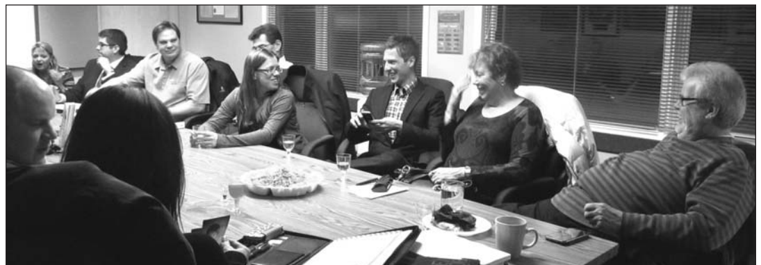
It wasn't all hard work at the Planning Session. Much laughter was shared as well!