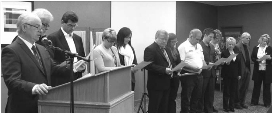
The Installation of the Directors is a decades old tradition of the Yorkton Chamber of Commerce.