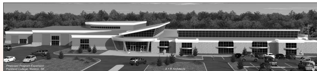
The establishment of the Trades and Technology Centre proposed by the Parkland College will have a tremendous economic impact on Yorkton and the region.