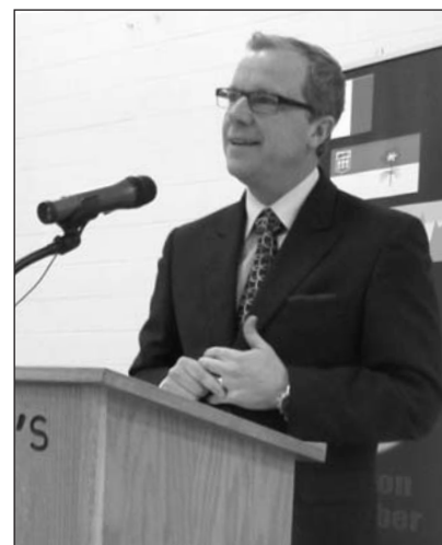
Premier Brad Wall outlined the province's plans for the future at a recent Chamber Lunch.