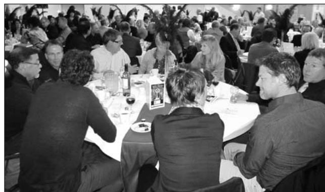
A sell-out crowd attended the Chamber's Business Dinner in October