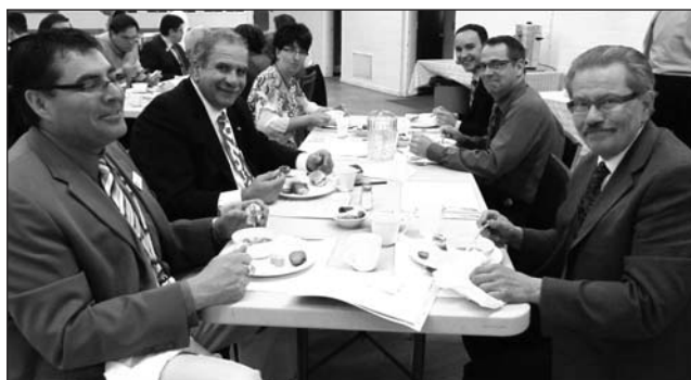
Chamber members attended 9 Business Breakfasts or Lunches