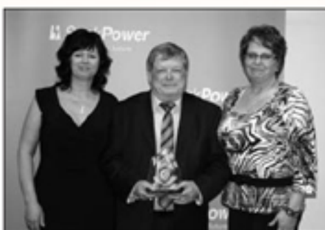
Crusader Drilling displays the Business Expansion Award sponsored by Bank of Montreal.