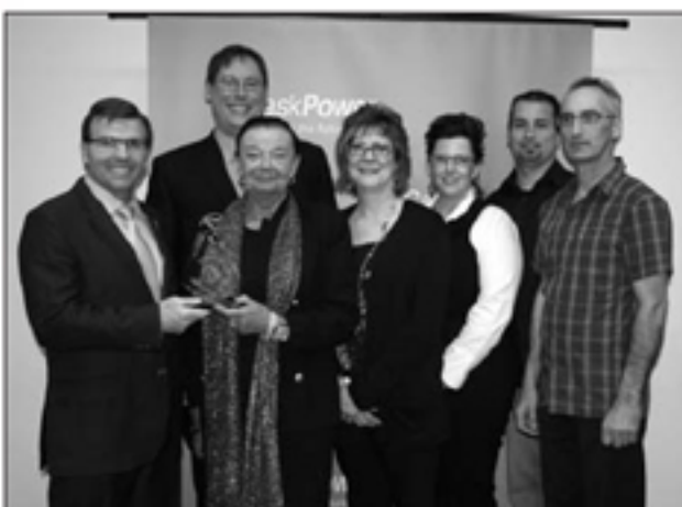
Access Communications was also a recipient of the Community Merit Award.