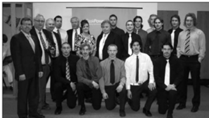
Directors, Office Staff, Coaches and Players from the Yorkton Terriers organization also accepted a Community Merit Award.