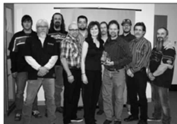
Harley Davidson Yorkton was also a recipient of the Award of Excellence sponsored by ParkerQuine LLP.