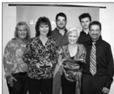
The Award of Excellence sponsored by ParkerQuine LLP was also presented to Yorkton Aircraft Services.