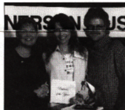
Business of the Year:

Sponsored by Business Development Bank of Canada