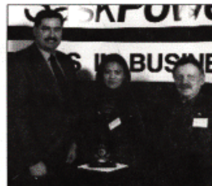
New and Expanded Business: PARKLAND GREENHOUSES LTD.