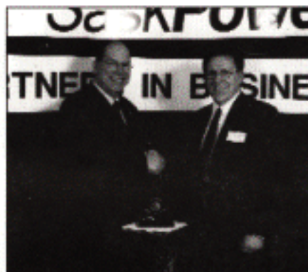
Property Restoration: FRAMEWORKS LTD.