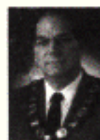
PHIL DE VOS Mayor