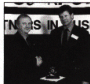
Top Right - Christie Hill Funeral Chapel Bottom Left - Logan Stevens Construction Bottom Right - Parkland Tire & Services