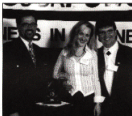
Community Involvement: SHERRING GOLD

to the Winners of the "Celebrate Success Awards" 2004