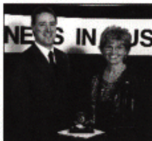
Top Right - Kalyna Ukrainian Dance Competition Bottom Left - Yorkton Arts Council Sunflower Bottom Right - Yorkton Community Theatre