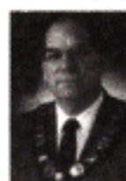
PHIL DE VOS Mayor

www.city.yorkton.sk.ca email: mayor@city.yorkton.sk.ca